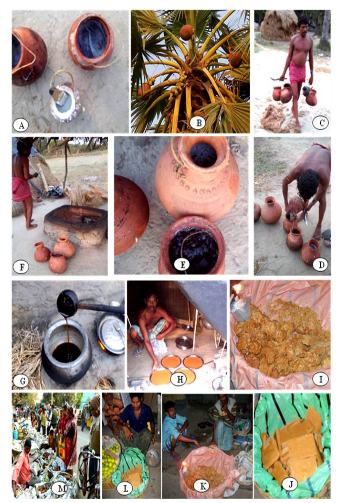
Plate 1 : A. Pitcher (Vaar) coated with lime, B. Female inflorescence is covered with pitcher, C. An ethnic people carrying the sweet sap, D. Mixing all the sweet sap, E. The pitcher with full of sweet sap, F. Preparing for boiling, G. Concentrated sweet sap, H. Spreading sweet sap, I & J. Two types of patali, K, L & M. Sailing patali in local markets.